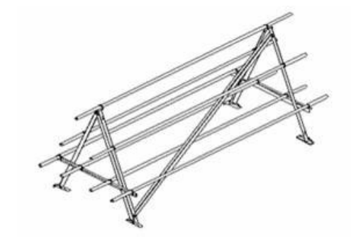
FIGURE 1: Examples of perches and platforms to be provided in rear

Training of hens to use the nest should start early in rear, with the use of perches and/or platforms to stimulate jumping and nesting behavior.