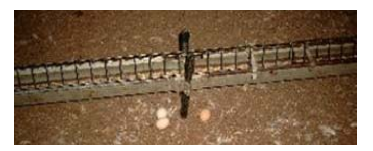
Figure 3: Floor eggs laid under feeder

The timing of feeding will influence the incidence of nonnest eggs. To avoid competition between feeding and laying eggs, birds should ideally be fed within 30 minutes, or not until 6 hours after lights-on. This is especially important for young pullets which have just been transferred as they will leave the nests to satisfy their appetite, often laying eggs at the feeders ( see Figure 3 ). Once this laying behavior has become established it is difficult to rectify. Two daily feeds should be avoided, especially after pullets have started to lay eggs. If a larger quantity of feed is required, one continuous daily feed, and not two separate ones, should be given.