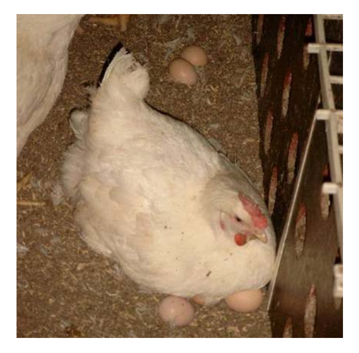
Figure 2: Pullet nesting by solid wall

Where automated systems are used, the egg gathering belts should be run several times each day, even before obtaining the first egg, so that the pullets become acclimatized to the sound and vibration of the equipment. It is good practice to initially run egg gathering belts slowly in conjunction with the operation of the feeders. After several days the egg collection system should gradually be run more often, increasing to several times during the morning and afternoon.